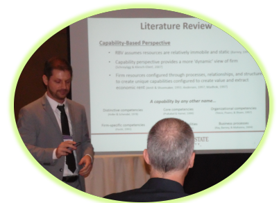
2014 SWAM Submissions by Tracks

various tracks from a total of 166 authors who represented a total of 22 countries (Belgium, Canada, China, Denmark, Ecuador, Germany, Ireland, Republic of Korea, Lebanon, Mexico, New Zealand, Nigeria, Philippines, Puerto Rico, Qatar, Russian Federation, Singapore, Switzerland, United Arab Emirates, United Kingdom, United States and Vietnam). I am happy to note that our conference generated interest and participation from scholars worldwide. Another healthy trend was the record number of doctoral students participating in various roles as authors, discussants, and session