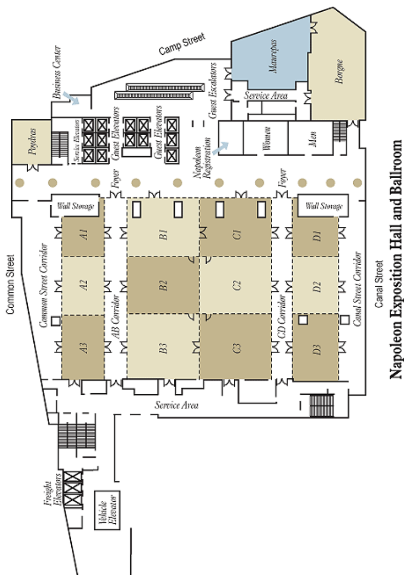
Napoleon Exposition Hall and Ballroom